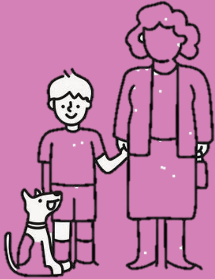
A mummy and her son