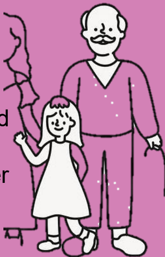
A Grandad and his Granddaughter