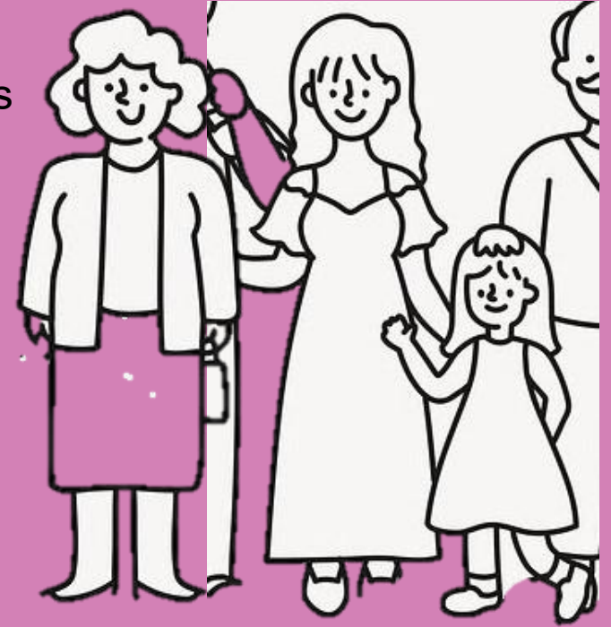
Two mummies and their daughter