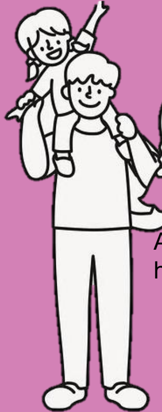
A daddy and his daughter